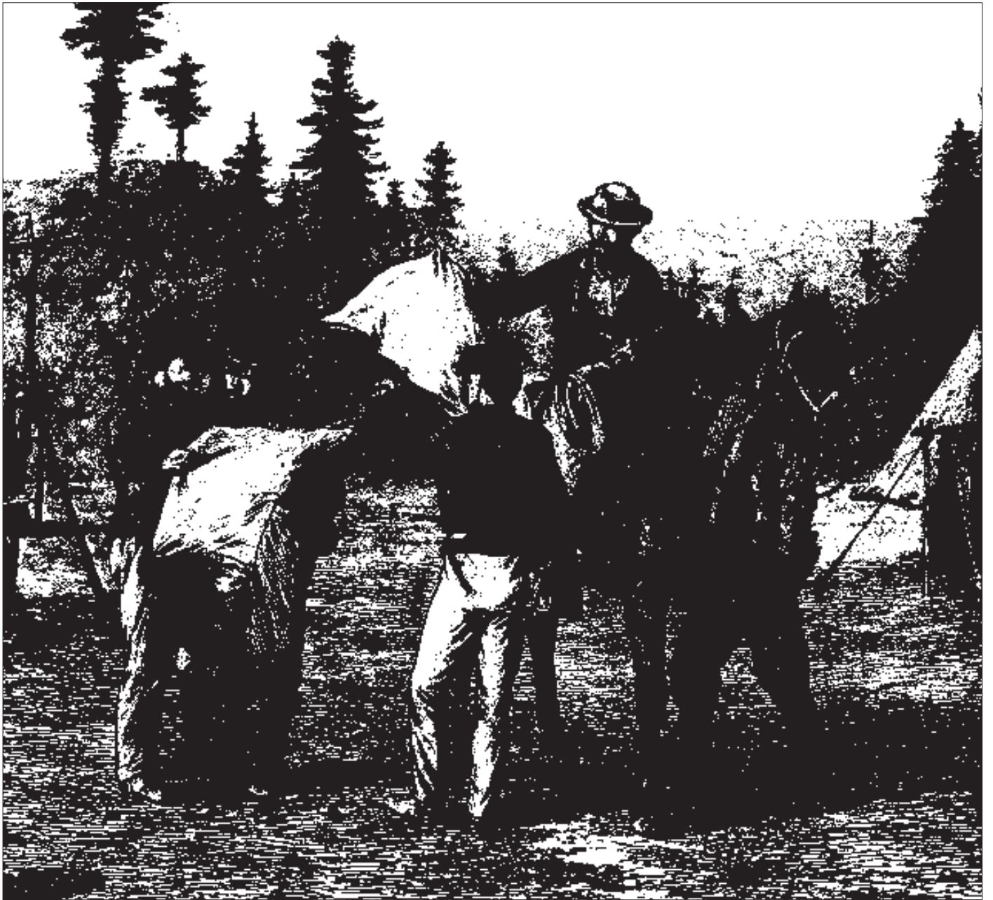
The importance of the latest news reaching Civil War troops is evident in Newspapers in Camp (detail), a copper-plate etching by Edwin Forbes from his Life Studies of the Great Army.