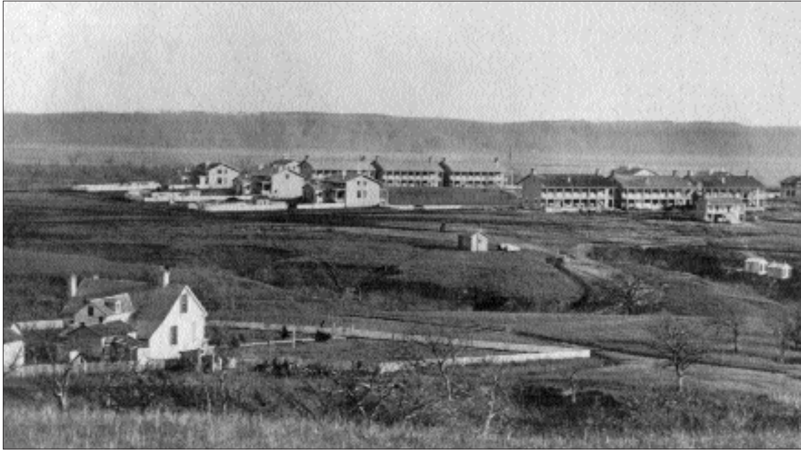
During most of its lifetime, the Soldier's Letter was published at Fort Riley, Kansas, which is depicted here shortly after the end of the Civil War.

brought recently to her minister $5. It was the first money she had ever earned. She wanted it to begin a monument for Abraham Lincoln, she said, without whom she would have remained nothing but a slave." 42 Yet another anonymous column centered around a convention of "colored men in Tennessee" and its political activities among loyal whites and the United States Congress. 43 The frequency and variety of such articles demonstrates an acute awareness that the fate of black Americans was firmly linked to the cause and outcome of the Civil War.