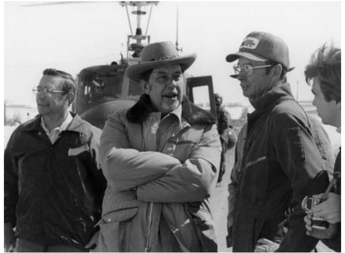
Bennett tried to balance his view that the best government is the one that governs least with what he called "the collectivism that's necessary for us to live happily." When natural disasters struck the state, for example, Bennett took action, as he does here during a visit to northwest Kansas in the wake of a 1976 "blizzard." In the background is his ride, a National Guard helicopter.

and restrictions to protect its profits. They perpetuate this type of intrusion. And even the so-called manufacturers of polluting engines have been known to lobby in such a fashion as to prevent somebody else's pollution while they let theirs go on. So everyone gets involved in utilizing the regulations to protect himself or to protect his profits. Where you strike the balance between the freedom that we all sort of like as we revere whatever individualism is today, where you strike the balance between that and the collectivism that's necessary for us to live happily, I don't know. It's probably the true art of government that everybody is still searching for.