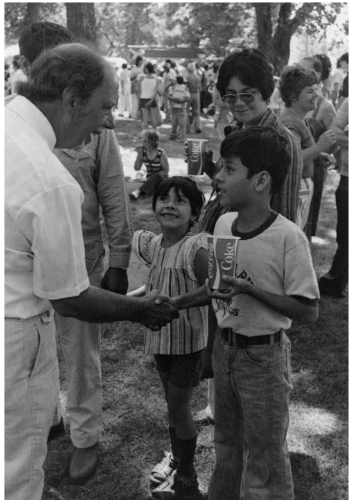
Political friends and foes alike admired Bennett's intellect and grasp of the intimate details of policy and government, but some observed that Bennett "never really connected with ordinary folks." This was not for lack of trying, as Governor Bennett does here with some young constituents at Beef Empire Days in Garden City, June 3, 1978.

that's the way you want to put it. With rare exceptions, Kansas has a great tradition of honesty in government. Something that may not be understood on the eastern seaboard is just the nature of the beast here. People know more about what their public officials are doing and hold them to a little higher standard. You do see from time to time that your political opponents try to make something out of an association that doesn't exist, and you have to be more concerned with the appearance of favoritism than with favoritism itself.